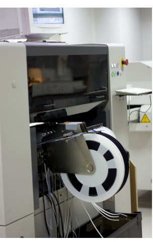
Pick & Place