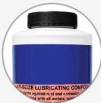
Brush Top Bottles